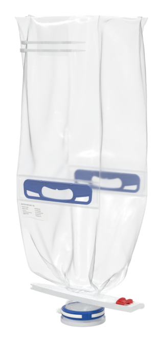
Cable Ties pre-attached for sealing top after filling