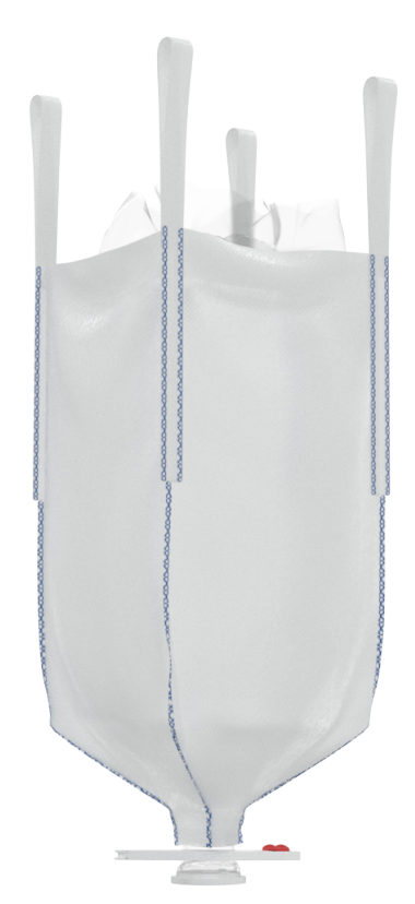
Mini Bag Option