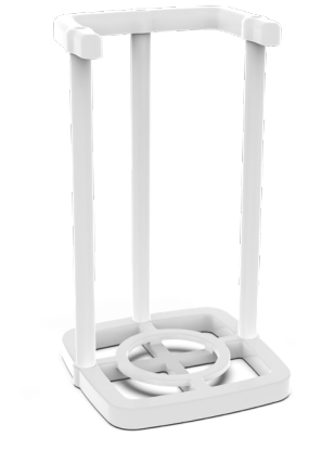
All-Plastic Filling Stand